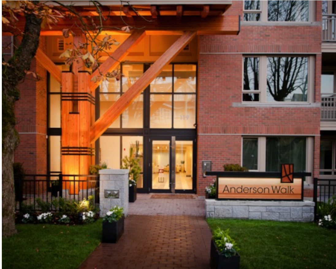
Anderson Walk – North Vancouver

HYAD HOUSING FOR YOUNG ADULTS WITH DISABILITIES