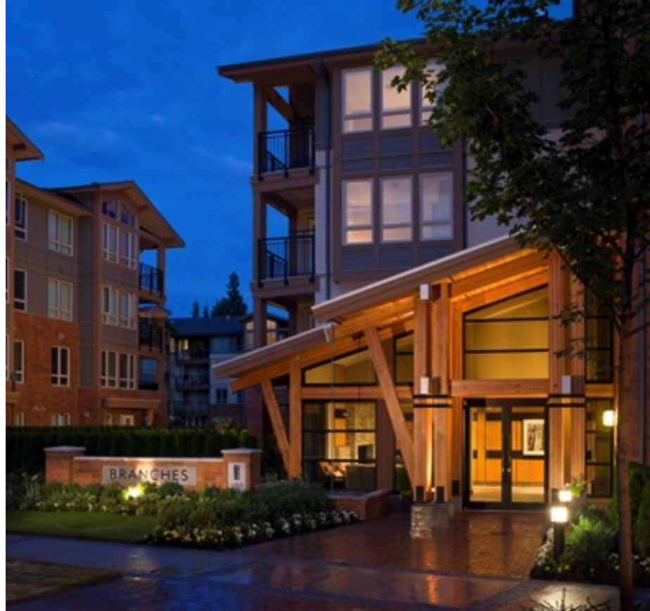
Branches – North Vancouver

Vancouver's Homebuilder of Choice for over 30 years