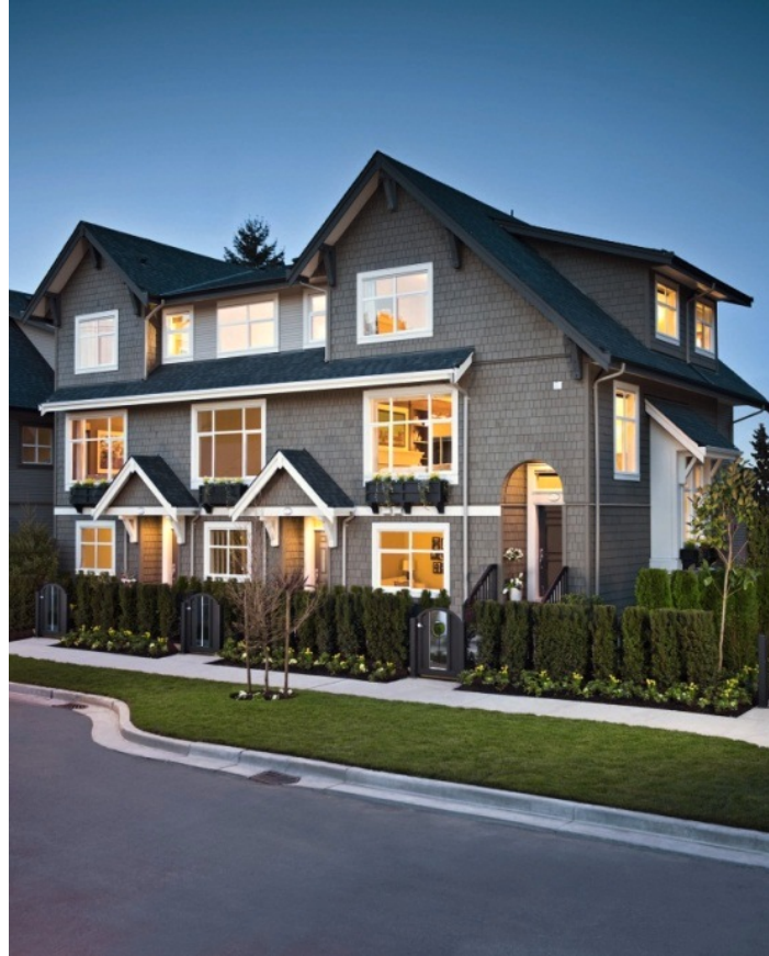
Wedgewood – North Vancouver

Vancouver's Homebuilder of Choice for over 30 years