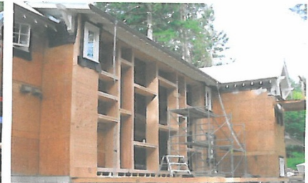
Private Residence Salt Spring Island, BC