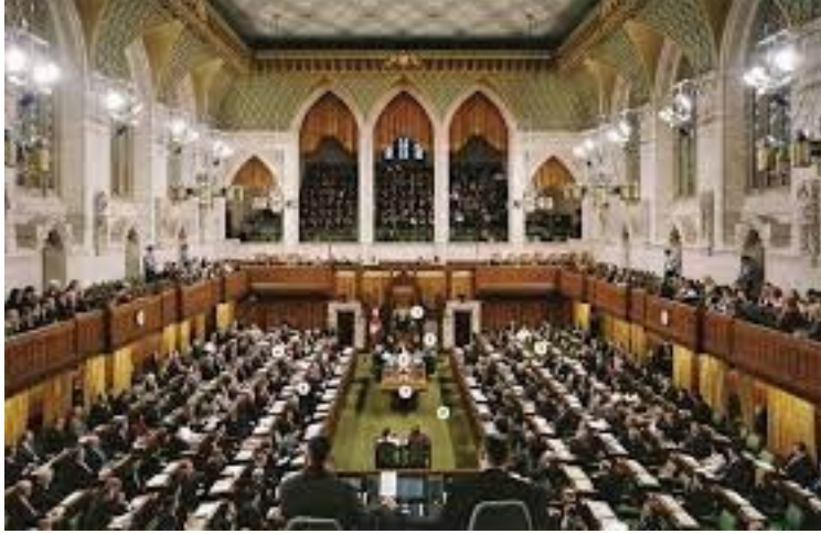
IMG_2570.JPG 35 KB

I look through multiple new website and the title catching my eye. As I read through my interest only grew since I had no idea there was a conflict happening in Ukraine which made me feel like I had inform myself on the topic