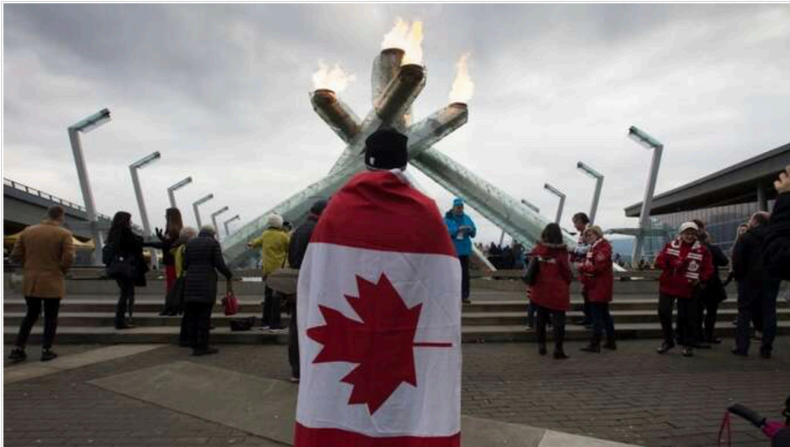
Olympic Games Canada · 68.7 KB