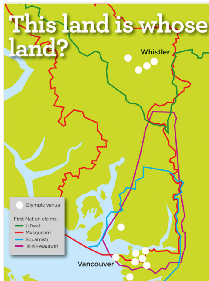
The planned location of the event · 56.1 KB